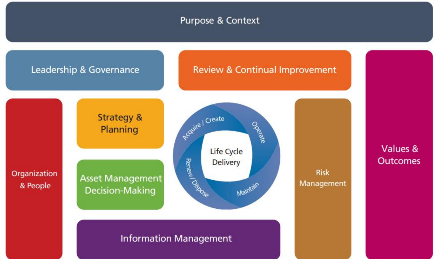
Figure 4: The IAM's 10-box Capabilities Model